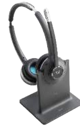
560 SERIES STANDARD BASE