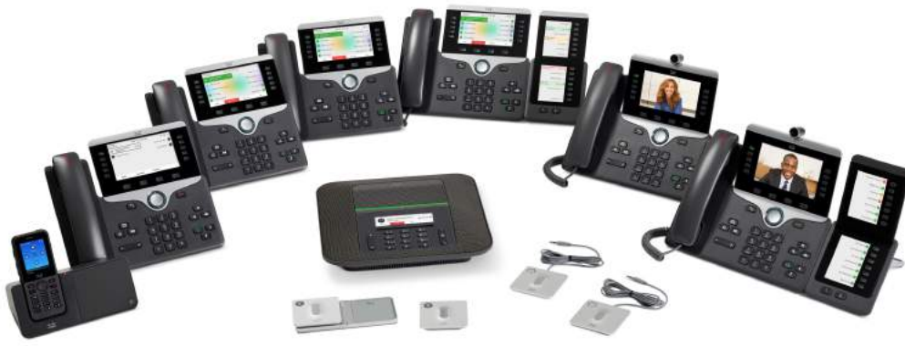
THE CISCO 8800 SERIES