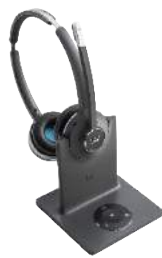
560 SERIES MULTIBASE