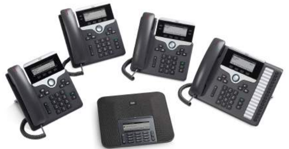
THE CISCO 7800 SERIES