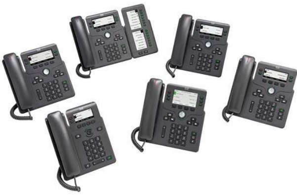
THE CISCO 6800 SERIES