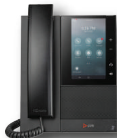
POLY - 500 CCX