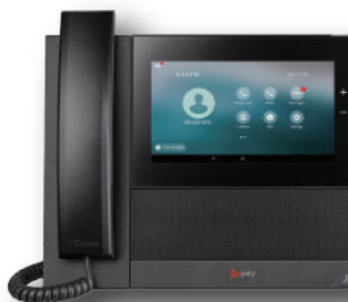
POLY - 600 CCX